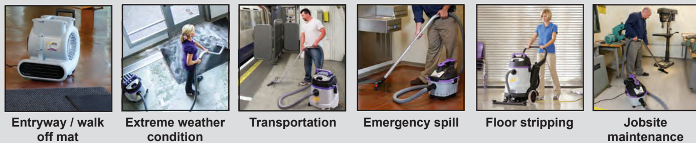
Entryway / walk off mat